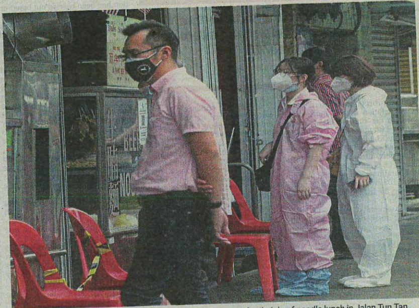
Taking precautions: Two women attired in PPE suits waiting for their beef noodle lunch in Jalan Tun Tan Cheng Lock, Kuala Lumpur.

He added that it was vital to maintain an efficient household iso-