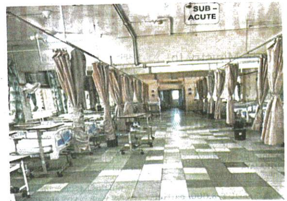
Duchess of Kent Hospital in Sabah converted a women's ward into a Covid-19 ward.

"Up to yesterday (Tuesday), 59.1 per cent of adults in Sabah have received one dose and 40 per cent have completed their vaccination."