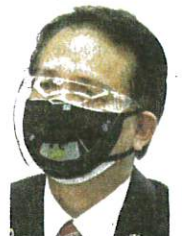
Tan Sri Dr Noor Hisham Abdullah

It said 60.5 per cent of the country's overall population had received the first dose of the Covid-19 vaccine, while 46 per cent had completed both doses.