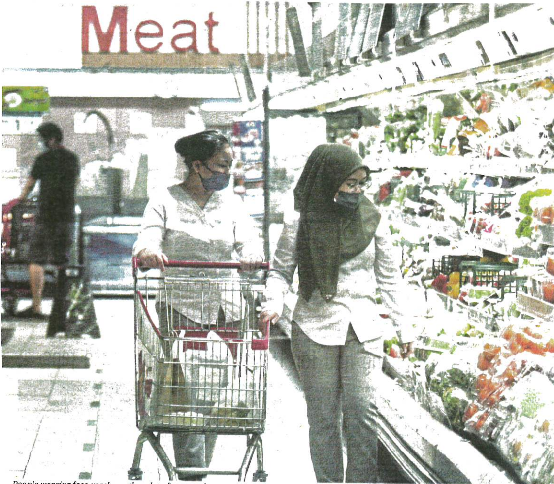
People wearing face masks as they shop for groceries at a mall in Petaling Jaya, Selangor, yesterday.

AKHBAR : NEW STRAITS TIMES MUKA SURAT : 3 RUANGAN : NEWS / STORY OF THE DAY