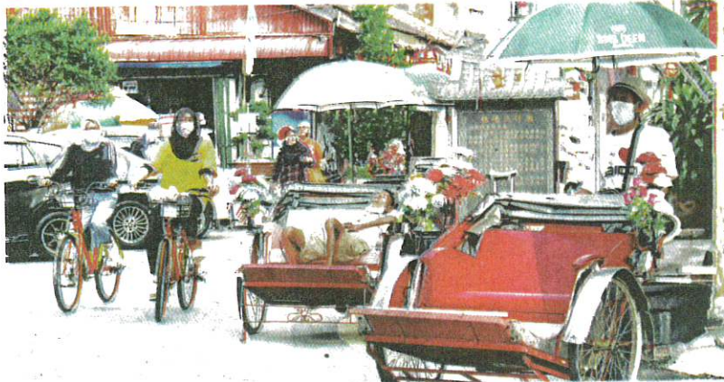
KERAJAAN bakal mengumumkan SOP baharu bagi persediaan untuk hidup bersama Covid-19 atau fasa endemik. – GAMBAR HIASAN

Turut hadir, Ketua Pengarah Kesihatan, Tan Sri Dr. Noor