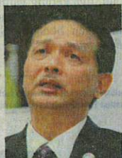
DR NOOR HISHAM

Menurutnya, sebanyak 21,073 kes sembuh direkodkan menjadikan jumlah keseluruhan individu